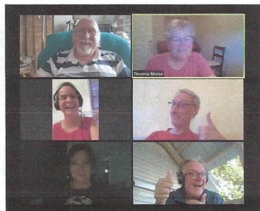
UPA Coffee Discussion - August 2020