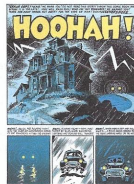
Everything begins with Mad Magazine