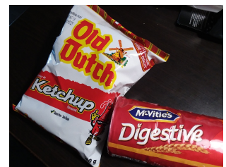
Because you can never get enough Canadian sodium...

Feature upon feature, short upon short, technique upon technique... and behind the scenes panel discussions from Disney, a pumpkin-slaughter fest at the picnic, and poutine. Canadian poutine. Canadian poutine and a Guinness. A Guinness record for Canadian poutine. You can get poutine in Ottawa at 4am. An evening of animation, a Guinness and poutine at 4am, followed by some ketchup potato chips. Save the digestives for the next morning (another survival tip). Don't tip the Canadian customs guards, and don't bring back more than 100ml of maple syrup. There are limits even to Canadian manners.