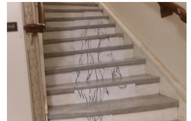
Art everywhere at the Fed Gallery