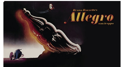
A discarded Coke bottle creates an evolutionary march to

(By the way, a typist's note here - if you aren't crying after the cat's performance from "Valse Triste," you have no soul.)