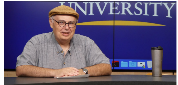
"I will never reveal the contents of my travel mug."

As I am thinking forward to next year, I want to let you know some of the great events and activities that your membership contribution provides for central U.S. chapter and ASIFA international. We are a volunteer run, 501c3 non-profit that supports the midwest of the United States with the goal to help promote progress towards peace and mutual understanding between all people as part of the Association Internationale du Film d'Animation . This coming year marks the 60th anniversary of our international UNESCO chartered organization!